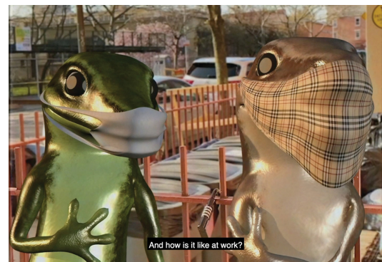
Orian Barki and Meriem Bennani, 2 Lizards : Episode 4, 2020, HD video, color, sound, 2 minutes 50 seconds.