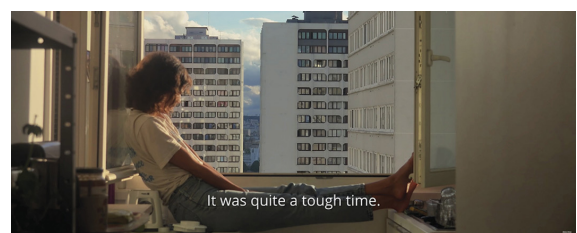
Mati Diop, In My Room , 2020, 4K video, color, sound, 19 minutes 59 seconds. Mati Diop.